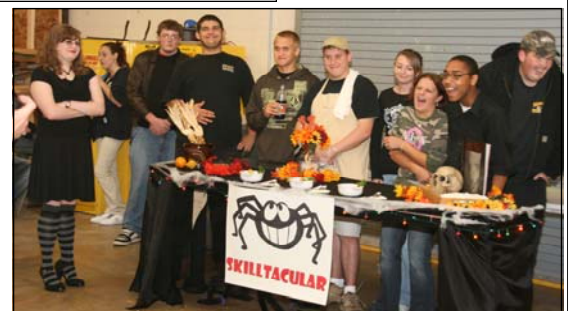
The Skilltaculars showed off their wonderful smiles!