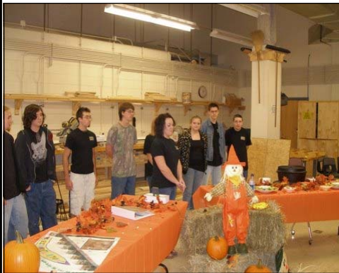
The Evolutionaries won the judges favor with their “sweet” chili!