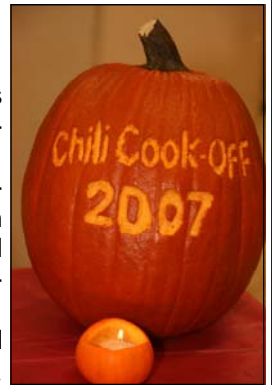
The Raptors provided a great memento for the event!