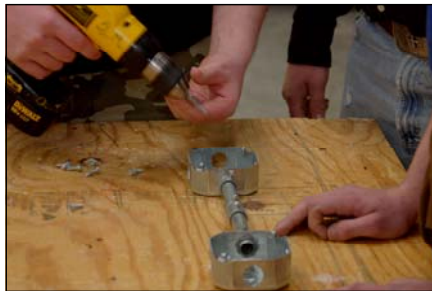
Students use various tools in the competitive event in the Electrical Technology area.