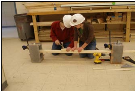
Students complete a project in the Residential Construction Technology area.

The students were introduced to innovative academic instructional strategies. All students signed up for Google e-mail and participated in a blog. All students also participated in a hands-on science activity.